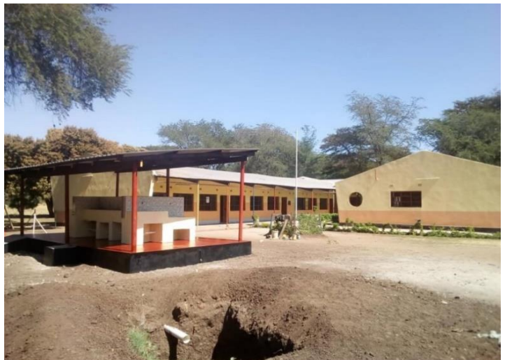
Expansion of Pre into Primary School. Linda Blind Farm School/Xavier Community School